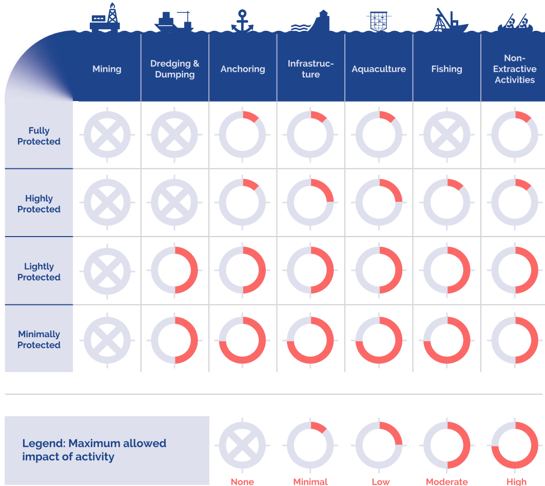
Fig. 1. Level of protection based on maximum allowed impact of seven potential activities in MPAs. An MPA or MPA zone can be categorized into one of four LEVELS of protection: Fully, Highly, Lightly, or Minimally, on the basis of seven types of activities and their impacts (a decision tree approach is available in fig. S2). Dials indicate the scale of impact that may be occurring at a given protection level: none, minimal, low, moderate, or high/large. If impacts are high/large, the

duration, and frequency relative to biodiversity conservation goals and is described as “none,” “low,” “moderate,” “high/large,” or “incompatible with biodiversity conservation” (Fig. 1 and fig. S2). Using this impact scale, a LEVEL of protection can be assigned for any given MPA or zone regardless of location, species, or circumstances. Impacts of certain activities may scale differently considering specific features of an MPA or zone, such as size; for example, distribution of an activity across areas of different sizes may render it high impact in a smaller MPA but moderate impact in a larger MPA. Incompatible activities include industrial extraction such as industrial fishing (for example, vessels > 12 m using towed or dragged gears), oil and gas exploration, mining, or other extremely impactful activities such as fishing with dynamite or poison (supplementary materials, LEVELS Expanded Guidance,