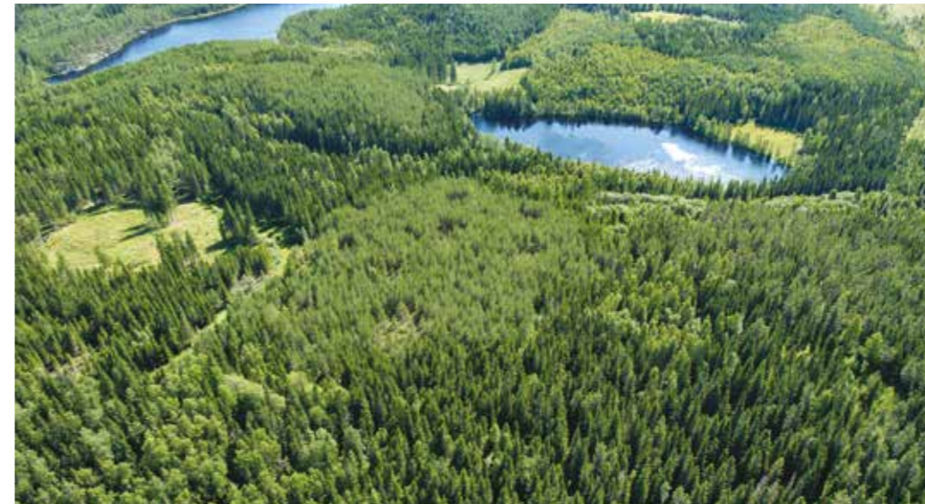
Restored Finnish forest

In the 2030 Biodiversity Strategy published in May 2020, the European Commission announced that it would propose "legally binding EU nature restoration targets in 2021 to restore biodiversity and degraded ecosystems, in particular those with the most potential to capture and store carbon and to prevent and reduce the impact of natural disasters". WWF welcomes the proposal as a key tool to contribute to halting and restoring biodiversity loss and for climate change mitigation and adaptation.