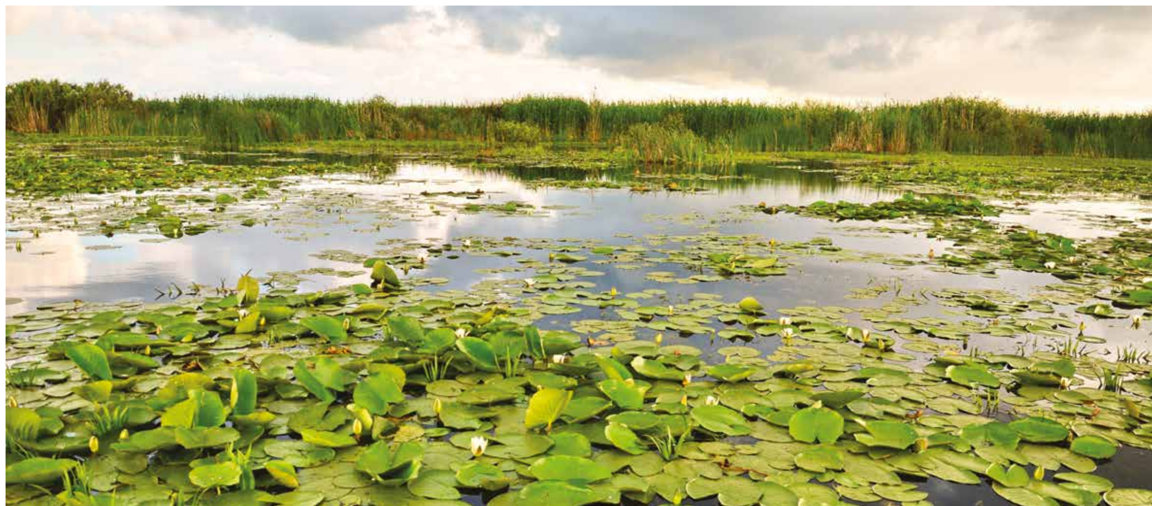
View of Mahmudia wetlands