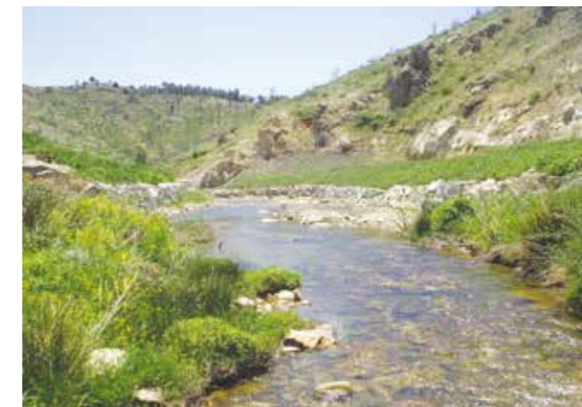
The Robledo de Chavela after demolition of the dam.