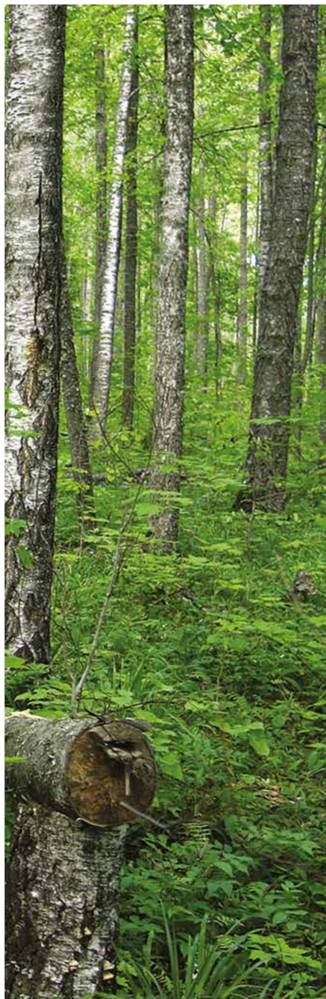
A restored forest in Finland