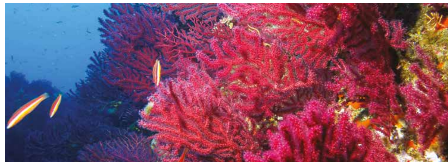
Biodiverse Habitat in the Côte Bleue Marine Park.